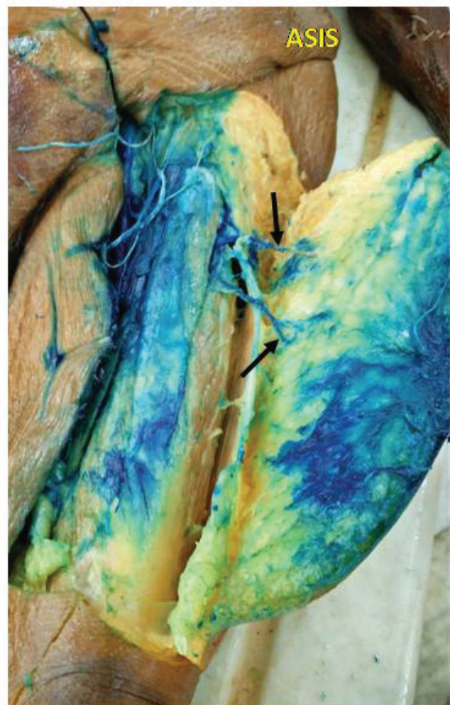
Figure 1: Perforators (black arrow) of LCFA in middle third of left thigh.

In this current study, we observed perforators of PFA in two rows, one along mid popliteal line and below gluteal fold (48.4%), and other below gluteal fold and at mean of 4.5 cm. lateral to midpopliteal line (51.6%), these perforators supplied the skin of posterior and posterolateral aspect of thigh respectively. Geddes et al. 2003, 5 observed average 7 to 8 perforators from PFA posterior to thigh, 3 to 4 perforators midline inferior to gluteal fold. Mean number of perforators along midpopliteal line was 3.06 \pm 0.3 , and that lateral to midpopliteal line was 3.3 \pm 1.0 . It was found that proximal most perforators along midpopliteal line were located at an average distance of 4.9 \pm 0.7 cm and distal most at an average distance of 11.9 \pm 2.5 cm. below gluteal fold having