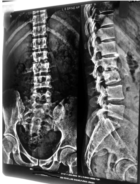
XRAY Of L.S. Spine Report ---

MTB detected very low, Rif resistant not detected.